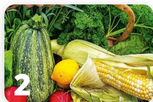
2 The world's food basket of choice